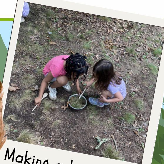
Making a bird nest